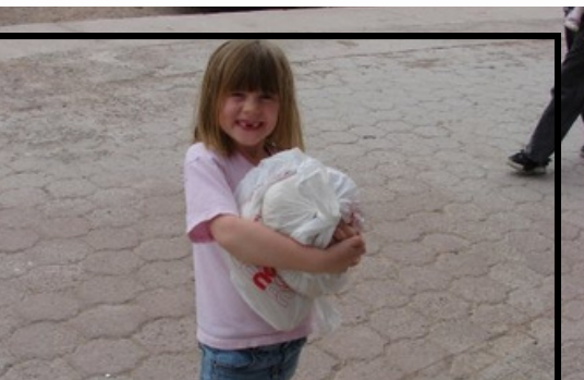
Kids are Welcome!